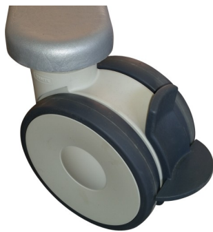
Castor with brake brake loose

Caution: During the transfer of patients from or to the lifter, both rear castors' brakes must be locked.