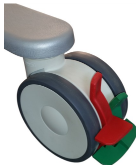
directional stability activated