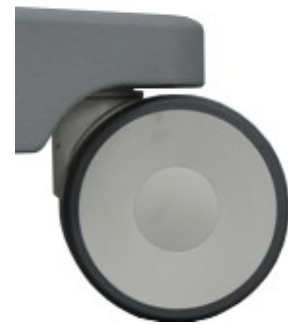
Castor without brake