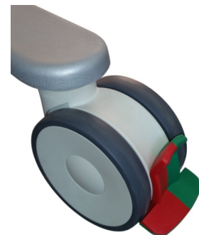
brake and dir.stab. activated